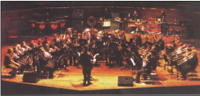
Performing on stage in the Christchurch Town Hall

The results sheets from the contest are listed here for your information: