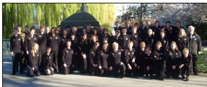
The NSSBB in Christchurch

But of course there has to be some sort of catch to it, because you can't just turn up. To be fortunate enough to be able to play in this band there is the process of applying before acceptance. This consists of practicing selected music and then auditioning with it. You receive the music and then its crunch time, you either practice or you don't; it all depends on how much you want to get in. Then after preparing you go for your audition. This can be the scariest experience if you have never done it before, but it's nothing to stress over (as I have been told numerous times). You go in, play then leave - It's all over within minutes. Many students apply each year but there are only a select number who get through.