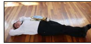
Tracey Hammond Cornet