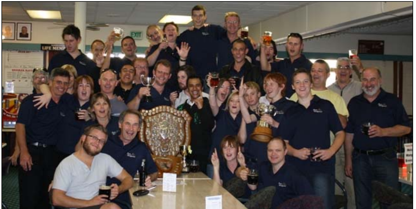
Brass Wanganui B Grade Champions 2009