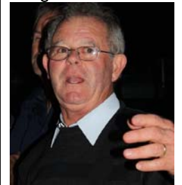
Ripper!! You little beauty!!