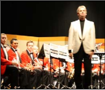
Nailed it!!! Even the cornets look pleased with themselves. Well, what work did they actually do, we ask?