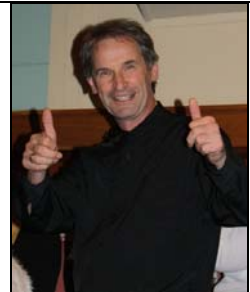
Yes, it's true! I am very pleased with myself!!!! Despite the bloody cornets!